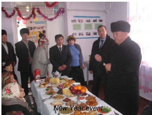
New Year event

Our Batken office organized a New Year event for elderly people in Sulucta with the administration of Sulucta town. Our beneficiaries in Sulucta took part in this ceremony and received presents from the Head of Batken district administration.