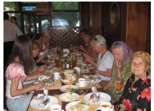
Dinner with tourists

During 2008, Babushka Adoption Foundation continued to build up and maintain a relationship between beneficiaries and their sponsors. Our team acted as a bridge between sponsors and their beneficiaries by translating letters, helping beneficiaries send letters to their sponsors, delivering gifts and additional money, and organizing meetings of sponsors with babushkas. We translated 339 letters from babushkas to sponsors, 83 from sponsors to babushkas, delivered 61 parcels from sponsors to our beneficiaries (39 in Bishkek, 22 in Batken), and disbursed additional payments from sponsors such as Christmas or Birthday presents to 71 of our beneficiaries. Extra donations total was $7 240 USD. We organized 10 meetings of sponsors with babushkas. Our elderly people very much like to meet their sponsors and speak with them about their life stories.