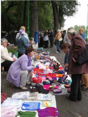
Fundraising part of the action

Babushka Adoption Foundation continued the membership of AgeNet Central Asia without Borders. Together with partner organizations we organized an annual charity activity “From Heart to Heart” on May 20, 2008 in the centre of Bishkek, as well as activities for Elderly People’s Day on 30 th of September. We organized a music concert, chess tournaments, sales of Self-Help Group handicrafts and products, and served hot tea.