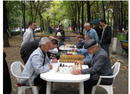
Fundraising part of the action