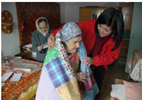
Distribution of humanitarian aid from IWC and Tian Shan Foundation

During this year we continued working with members of the International Women’s Club and Tian Shan Foundation, and received humanitarian aid for elderly people, such as clothes, bedding, food and other urgent needs.