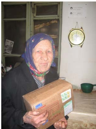
Babushka received parcel from her sponsor

In 2008 the new sponsors were mostly involved by existing sponsors and friends of Babushka Adoption Foundation who spread the word to their friends, relatives and colleagues. Babushka Adoption Foundation received 39 requests for information about sponsorship terms and out of that number 37 became real sponsors.