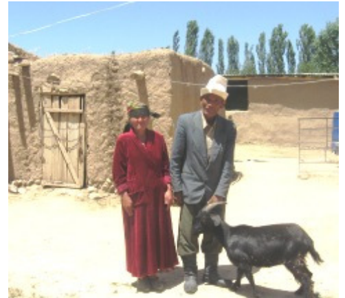
Babushka and Dedushka are happy to receive a goat

In addition to providing financial and social support Babushka Adoption Foundation provided our beneficiaries with agricultural support, by purchasing 20 goats and delivering them to the neediest beneficiaries living in Leilek district of the Kyrgyz Republic. The donation of these goats provides an additional source of stable income for the beneficiaries of Babushka Adoption Foundation. In addition goats, we provided the self-help groups with two sewing machines and two kitchen cookers. The funds were allotted by International Experts and GTZ regional office in Kyrgyzstan.