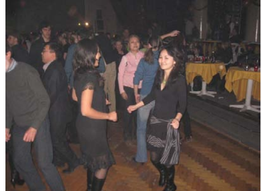
Christmas Party with Latino flavor