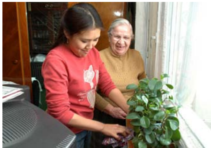
Social Worker helping babushka