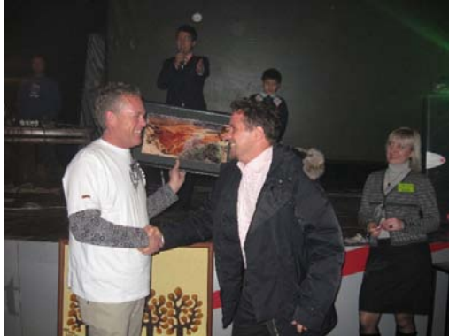
Christmas Party with Latino flavor