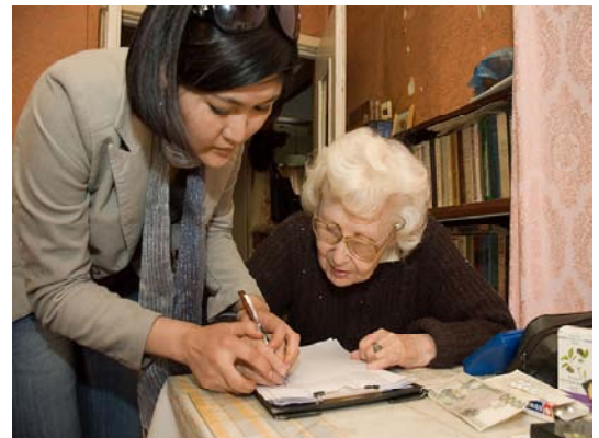
Babushka is receiving sponsor's money

Having collected the questionnaire results, BA staff members determine the neediest and the most vulnerable applicants who best fit the criteria. Their biographies are translated into English and profiles with photos are prepared for potential sponsors who are willing to “adopt” a babushka or dedushka.